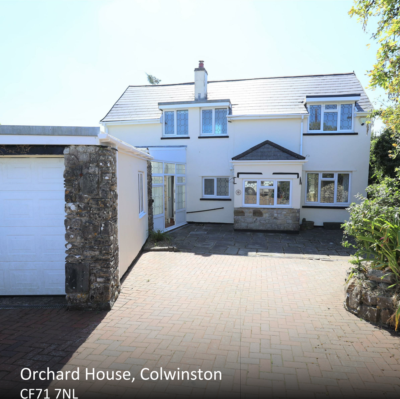
Orchard House, Colwinston CF71 7NL